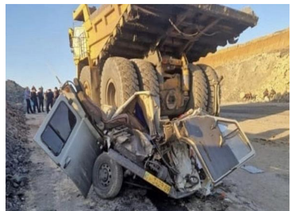
Figure 2. Mining haul truck drive over light vehicle in Kazakhstan

Operator fatigue due to monotonous driving brings to collisions with mine environment and other vehicles as shown