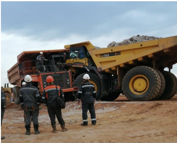
Figure 3. Two mining haul trucks collide due to operator fatigue in Kazakhstan

in Figure 3. Haul road profile and condition is another major contributor to mine site hazards and cost of production. Use of proper tire handling tooling and maintenance of electrical parts of trucks as batteries can reduce contribution of number of accidents as well.